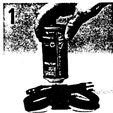
1 Fill the Unit