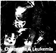
Chlamydia & Leukemia

Focus 5 is recommended for cats that roam outdoors, live with many other cats, are housed in shelters or where new cats are introduced.