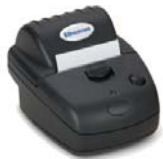
Shown with optional printer AWT05-505591