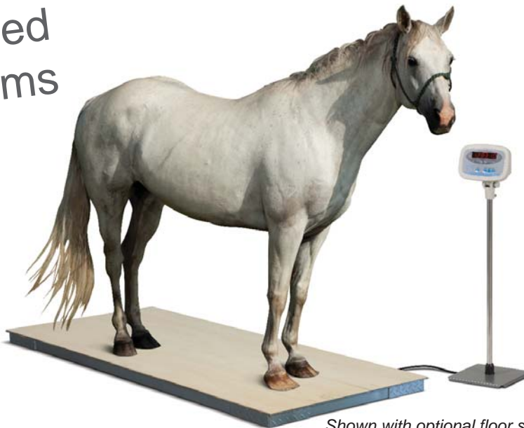
Shown with optional floor stand