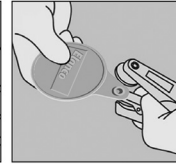
Figure 2 Slide tag under the clip of the pliers by depressing the lever.