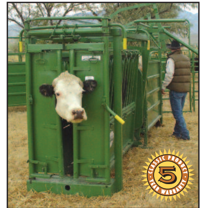
XL Chute w/Self-Catch Head Gate Order No. 002-20056

The XL Chute with Self-Catch Head Gate includes all the features listed above. It is the same chute as the XL manual, with the exception of the Head Gate. The self-catch Head Gate allows you to work the alley more efficiently and not have to stay at the Head Gate. It is not recommended for horned cattle.