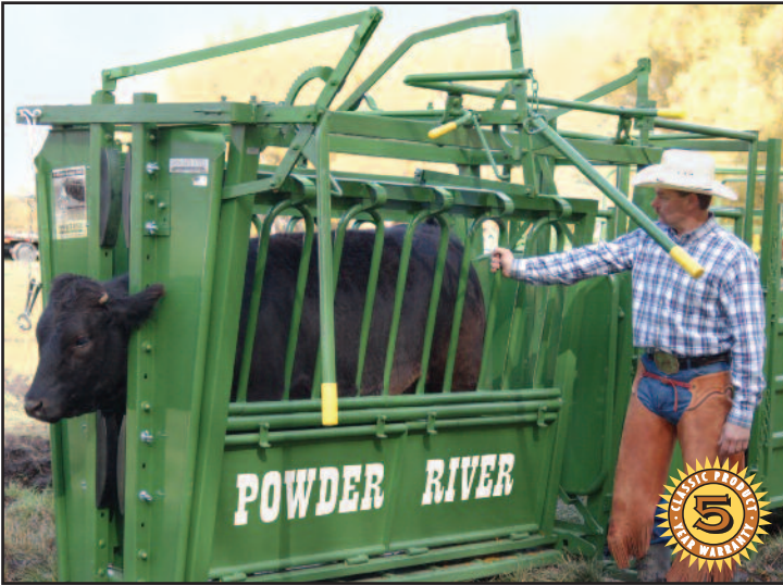
XL Manual Chute with Right Exit Order No. 002-10052

The Powder River XL Manual Squeeze Chute with Right Side Exit is Powder River's top selling squeeze chute. This chute will stand up to the toughest of conditions. It will handle bulls, large cows, and even calves if necessary. If you are debating between a Value Chute and the XL Chute, go with the XL. It will hold its value and last for many years to come, no matter how many head you run through it.