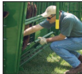
Hinged Kick Panels

Sheeted Split Tailgate keeps animals from backing up in the chute.