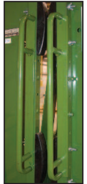
Bolt-on Neck Extender Order No. 002-20000