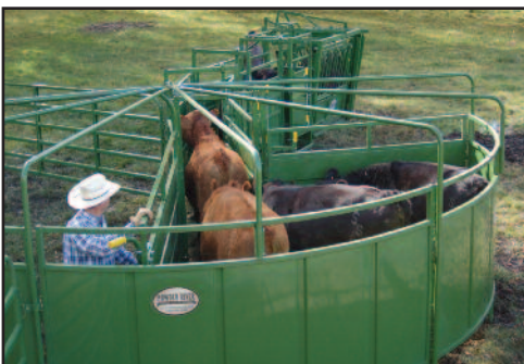
Cattleman's Tub can be assembled with either a center or end exit