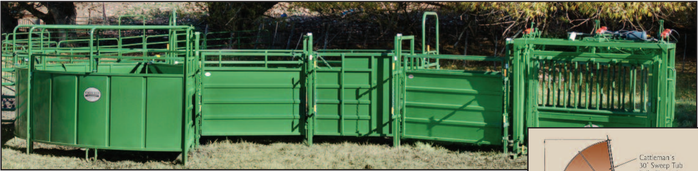
Cattleman's Tub and Alley Package Order No. 006-30000

The Cattleman's Tub and Alley is one of Powder River's most popular sweep tub and alley systems. If you desire a sheeted system and System 2000 is out of your price range, the Cattleman's System is for you. The Cattleman's System is 67" tall, allowing you to work cattle without the need for a catwalk, giving you a sturdy, functional working system in a very competitive price range. The 20' alley can be set up straight or curved and the tub can be set up for end or center feed.