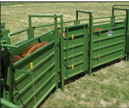
20-foot Curved Alley