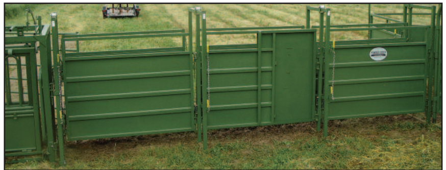
Cattleman's 20-foot Straight Alley