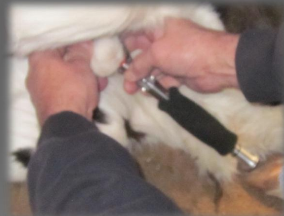
Animal lying on side

Caution: Always verify that both testicles are captured before releasing the loop.