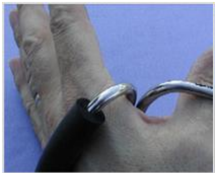
Begin By Slipping the Left Hand In the Tool.

Roll up a towel to simulate the scrotal sack. The bands arrive pre-assembled and are easy to use. To use the California Bander: