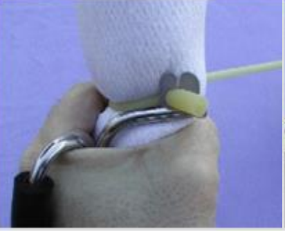
Pull the Stretched Band Around the Scrotal Sac.