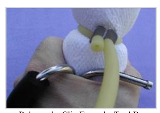
Release the Clip From the Tool By Slightly Tipping It Backward. This Will Leave the Band With the Clip Attached On the Scrotal Sac. The Rubber Tube Does Not Need to Come Off. If You Can Fit Your Finger In Between the Band And the Scrotal Sac, You Do Not Have the Band Tight Enough.