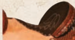
Bicycle w/ Buckstitch