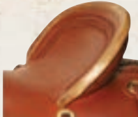
Pencil Roll Rawhide