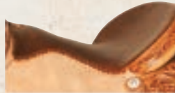
Full w/Pop Stitched

Options: Pop Stitched $80, Quilted $35, Buckstitch $100