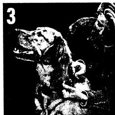
3 Strap it to the dog