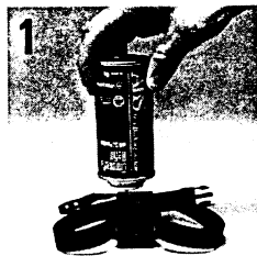
1 Fill the Unit