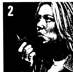
2 Test it by blowing on microphone